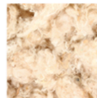
ACRYLIC BEIGE-CREAM FIBERS