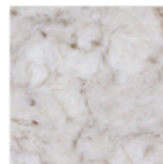
POLY-COTTON WHITE FIBERS