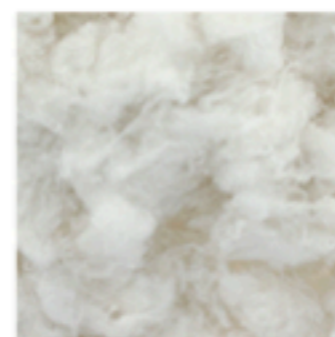
ACRYLIC WHITE FIBERS