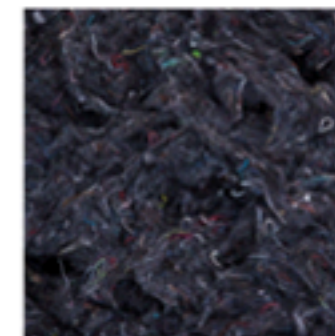
ACRYLIC MULTI-COLOR FIBERS