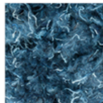
100 % JEANS FIBERS